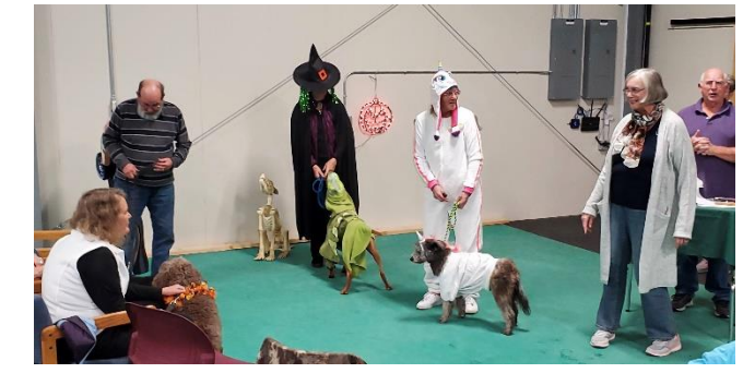
The audience voted for as many costumes as they felt like, making everyone a winner.

The games were preceded by an amazing variety of snacks from spooky mummy dogs to cheese trays and hot apple cider.