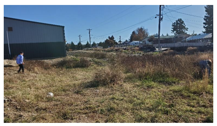
November 1: A Weed Patch