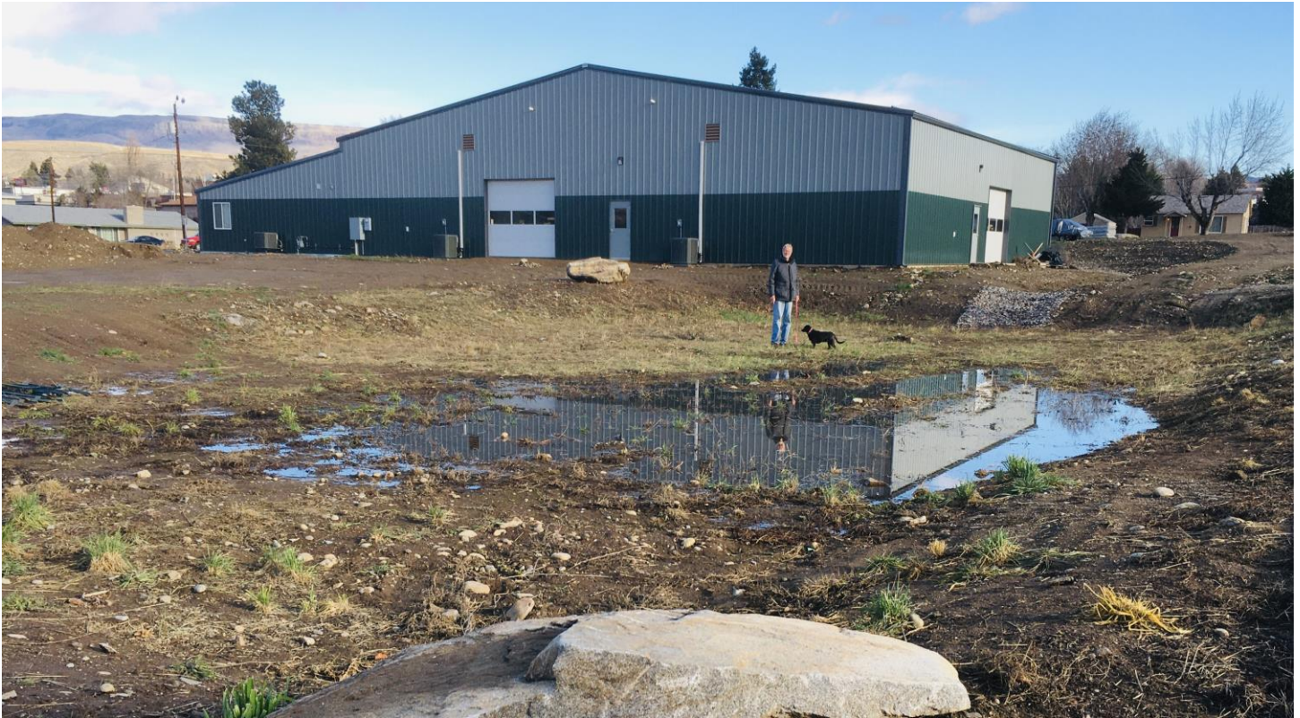
John Njus and Evita check out the detention pond.

What’s important about the southwest corner of the property? Answer: The Detention Pond . The purpose of the low-lying area is to detain rainwater coming from the rest of the property until it soaks in. The storm that came through early on New Year’s Day demonstrated that the runoff from the building and the parking lot makes its way to the pond, and there were no puddles in the parking lot. Grass will be planted in the detention pond this spring.