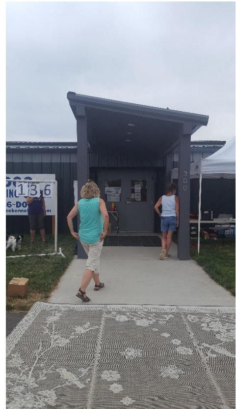
A number board helps keep participants distanced while letting them know who runs next..