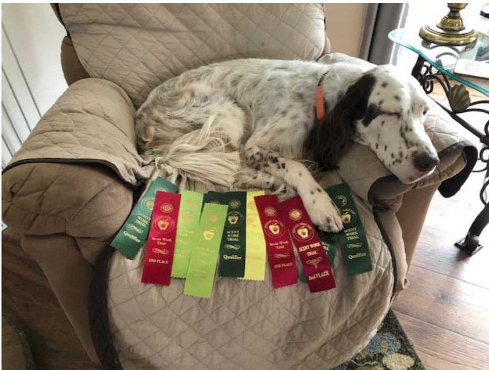
Hayden: Dog tired but loving every minute of scent work.