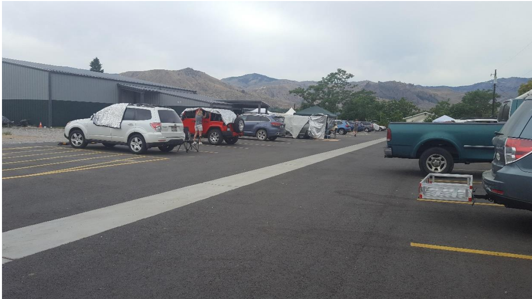
The parking lot at the training center during the Scent Work Trial. Only every other parking space is used to provide participants with extra room as part of the COVID-19 precautions.