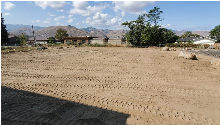
Irrigation lines in place and final grading in process

Thursday, September 17 th , construction of an outdoor training ring began on the west side of the Training Center.