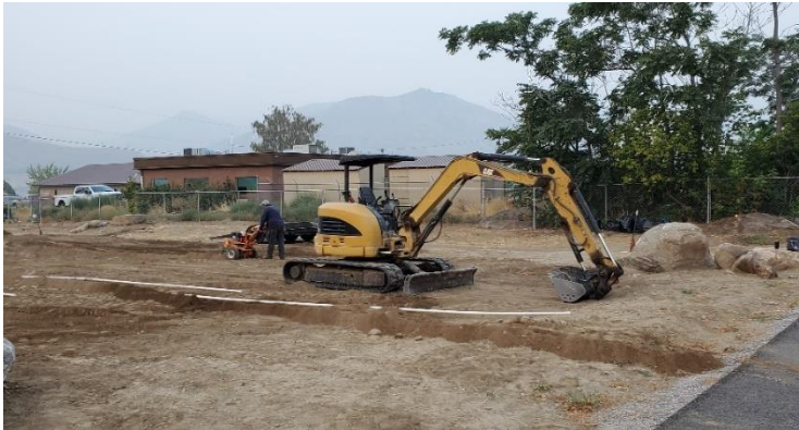
Trenching and laying irrigation lines.