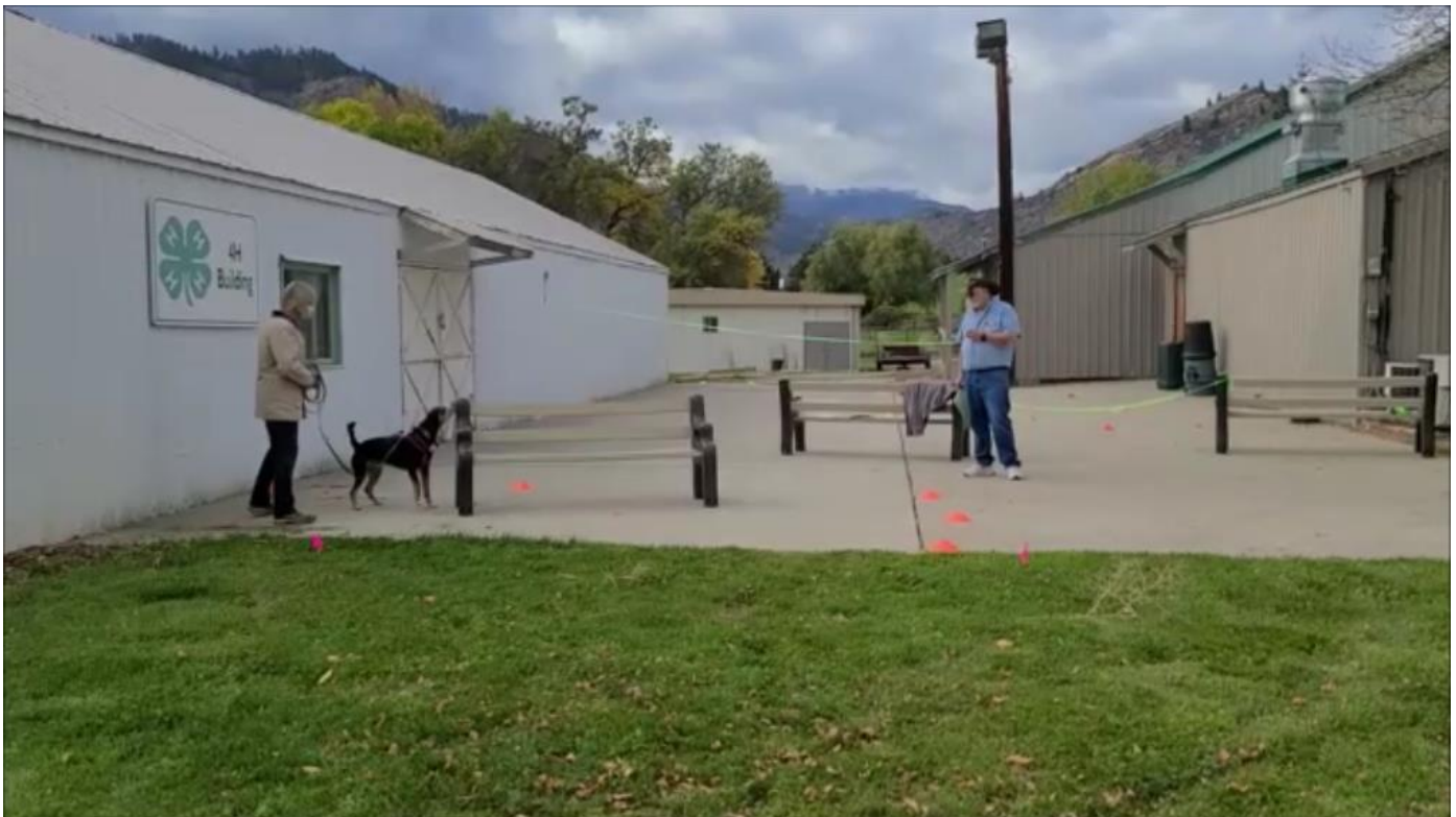
Above: WKC club member Sue Edick and her dog Cubby do an Exterior search while the judge watches. Orange cones are used to mark off the search area. Each Exterior search at each level requires a pristine search area for each day; fortunately, the Cashmere Fairgrounds was large enough to provide all 12 Exterior search areas needed for the trial.

Otter: Good sniffing! Got petted! Got treats!