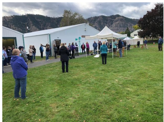
At right: Participants listen while Mike Barclay, Scent Work Trial Chair, starts the morning briefing.

A scent work search has time limits, ranging from 2 minutes for some of the simpler classes up to 9 minutes for some of the advanced classes. So doing a search, with fewer than 5 masked people in a good size building, felt much less risky than a typical trip to the grocery store.