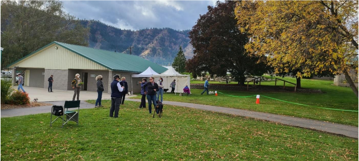
Above: The white tent in the background is the "blind" where each pair waits for their turn to do an exterior search.

In the Brags section of the newsletter, you'll see people refer to "Q"s or "Non-Qs". That means searches that either count toward getting a title (Q=Qualifying) or don't. To get a Q, you have to find all the scents within the time limit, and also not commit a major fault. I think this was the first year Otter and I didn't have any disqualifying faults.