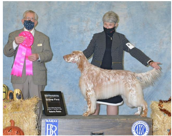
GCH Stagedoor Set'r Ridge's Walk In the Word (Spirit, at right) finished her Bronze Grand Champion title in Coeur D'Alene shows. She also took two Sporting Group 1s and a Group 4 at these shows.