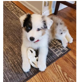
Welcome to Austin (aka Auzzy)!