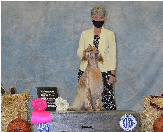
One of Spirit's NOHS Group Placements at Coeur d'Alene Shows