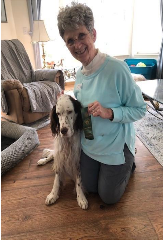
GCH Ch Set-Point Dreaming In Chocolate SIN SCN SBN owned by Norman and Louise Day received two qualifying ribbons, one in Handler Discrimination and one in Containers at the Wenatchee Scent Work trial.