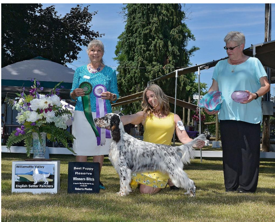
Set'r Ridge's Set-Point Eternal Desire shown here taking Best in Sweepstake's ( 1^{st} picture) at the Willamette Valley English Setter Speciality and taking Best Puppy in Speciality and Reserve Winners Bitch ( 2^{nd} picture).