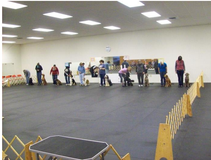
A class at the old training center on Valley Mall Parkway in 2013.

For a while, our meetings and various classes were split between three different facilities in Wenatchee: 1) a building at the Appleatchee Riders property, 2) the Metcalf Ranch, and 3) the old post office on the ground floor of the federal building on Yakima Street (now City Hall). Some members were saying that, in addition to a building, we needed an outdoor training area. So the Board looked into the feasibility of buying land and constructing a brand new training center, made to order.