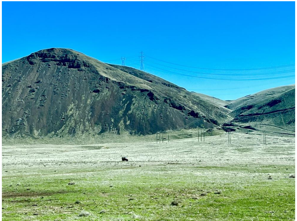
The site of the tracking trial, in the beautiful Palisades area

Every March, the Wenatchee Kennel Club holds an AKC Tracking Test. Tracking is the art of a dog following the trail of where a person has walked. The "TD" test requires that a dog follow a track that is between 440 and 500 yards in length, with 3 to 5 turns, where the scent is between 30 minutes and 2 hours old, to find an article (usually a glove). The "TDX" test requires that the dog follow a track that is between 800 and 1000 yards in length, with 5 to 7 turns, where the scent is between 3 to 5 hours old, find 3 articles, and ignore cross tracks from 2 people at several locations - it is a very difficult test! On the following pages is the summary report of this year's tracking trial from Trial Secretary Heather Stiver.